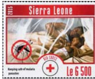
post office & child