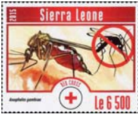
A. gambiae & worker