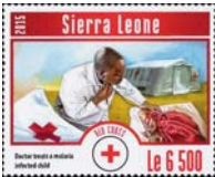
A. gambiae & worker

Design Size: 45 x 37 mm Margins: clear Sub-topics: mosquito Notes: singles from compound sheet Price: C