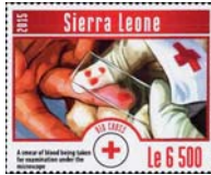
Red Cross flag & worker

Design Size: 45 x 37 mm Margins: clear Sub-topics: mosquito Notes: singles from compound sheet Price: C